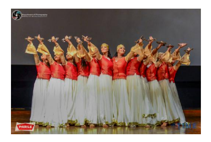
Students performing during Natyanjali