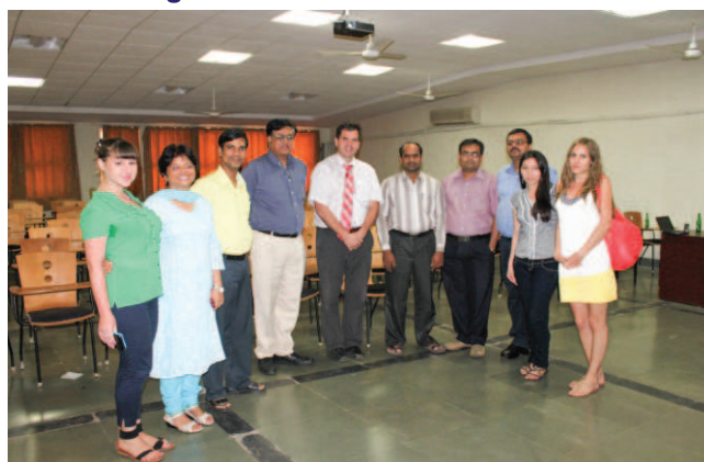
Delegates at Roundtable Conference

The Roundtable was jointly organized by KIMEP University and the BITS Pilani, K K Birla Goa Campus. Beginning with an introduction to KIMEP University, the Roundtable gave an overview and comparison of the tax system and an introduction to international taxation. Special presentations on Goa Winter Tax School 2013 were also delivered.