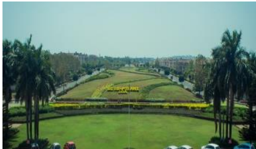
K K Birla Goa Campus