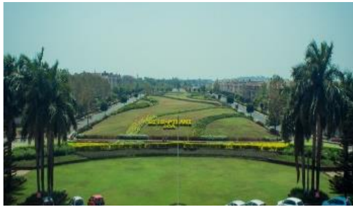
K K Birla Goa Campus