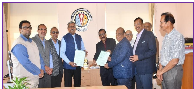
Alumni's Philanthropy: A Multi-Crore Endowment Fund for Scholarships