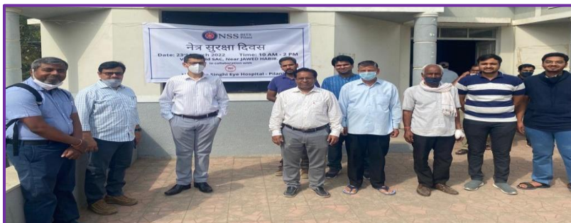
Netra Suraksha Divas

The camp was a massive success, with 316 people being checked by the team of doctors with more than 100 spectacles and 150+ medicines being distributed. The workers with severe problems in their eyes, who could not be treated on campus, received treatment at Mahadeo Singh Hospital. It was a great pleasure for NSS BITS Pilani to collaborate with Mahadeo Hospital and their hardworking team, who ensured smooth operation and made the camp a huge success.