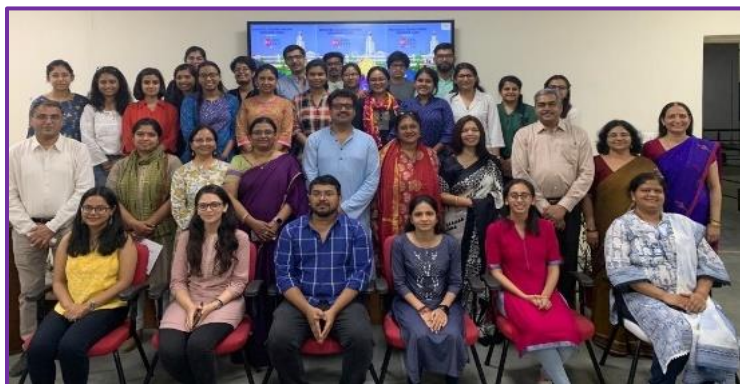
Academic Writing Workshop