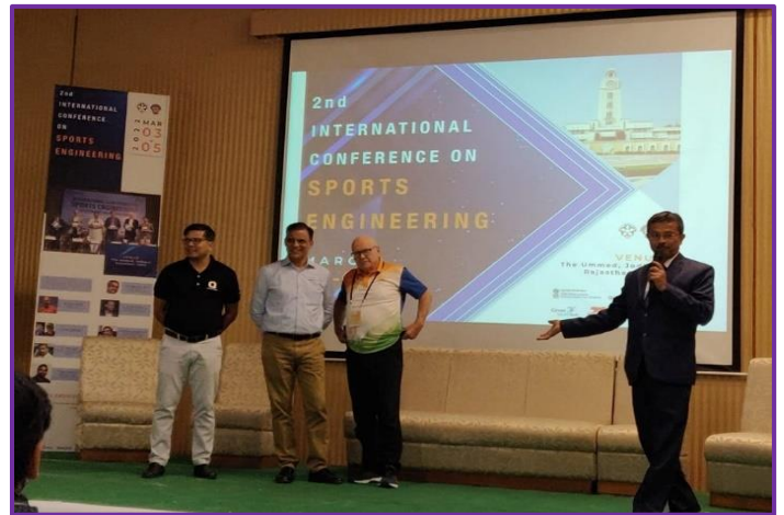
Second International Conference on Sports Engineering