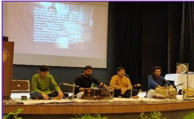
Chittarth Dagar Memorial Performance