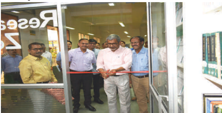
Inauguration of New Research Zone