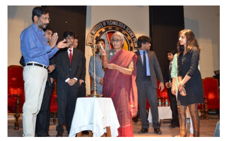
APOGEE this year has witnessed a participation of around 500 Science and Engineering students from all over the country. Various categories of projects included Automation, Communication and Network Systems, Design Appliances and Economic