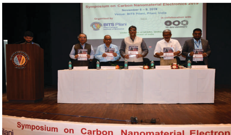
Symposium on Carbon Nanomaterial Electronics 2019