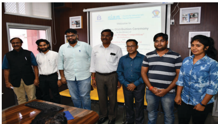
Academic Writing Competition