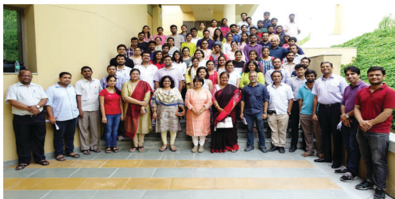
Teaching Learning Centre Workshop

3rd Indo-German Conference on Sustainability in Engineering: Enhancing Future Skills and Entrepreneurship was held during September 16-17, 2019 organized by the Indo-German Center for Sustainable Manufacturing, a joint project of Technische Universität Braunschweig, Germany and BITS Pilani during September 16-17, 2019. 60 participants from Germany, USA, and India participated in this two day conference.