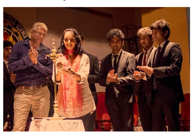
→ BOSM 2015 Events