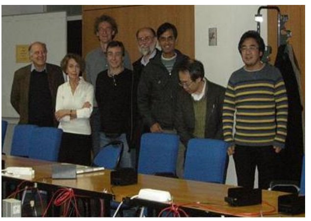
2011 for the International Research Staff Exchange Scheme (IRSES) project. This project is on A Multiple Scattering Computing Platform for (Nano) Materials and it will be submitted to The European Commission's 7th Framework Programme. The consortium under this