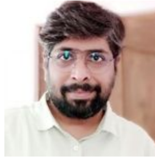
SAI RAM C V H S

Areas of Research Interests: Indian English Fiction, Mythic Fiction