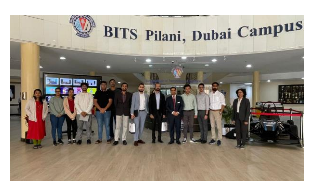
Group picture with guests & presenters