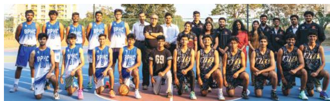
BPHC Basket Ball Team (Boys)

with the latest edition of our annual sports fest Arena '25. Inspired by the gladiator's spirit, this year's fest brought together athletes from across the country to compete in over 20 sports, including football, basketball, squash, tennis, and volleyball. The four days were filled with electrifying matches and thunderous cheers as students cheered passionately for their teams. Alongside the fierce battles, attendees enjoyed various activities such as face painting, twisted tambola, and street cricket, adding a fun and engaging atmosphere for everyone involved. A major highlight was the basketball finals, which showcased intense action and raw emotions. Both the women's and men's basketball teams emerged as champions, delivering a memorable double victory that energized the crowd and demonstrated exceptional skill and teamwork. Arena'25 truly embodied the spirit of competition and camaraderie, setting the stage for even greater challenges and celebrations in the years to come.