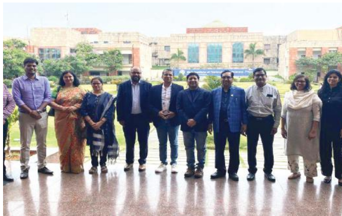
Delegates from FTCCI

On 7 th April, 2025, we hosted delegates from the Federation of Telangana Chambers of Commerce and Industry (FTCCI) to explore potential collaboration opportunities between BITS Pilani and industry partners through FTCCI.