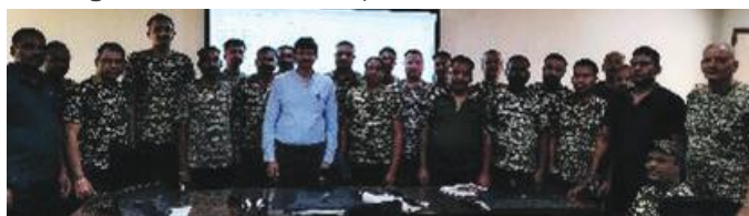
Faculty members with CRPF 10 th Batch participants during the closing session.

A training program for the 10 th batch of CRPF personnel was conducted on 22 nd April 2025, with a focus on introducing key digital and technological tools to aid in field operations and organizational efficiency.