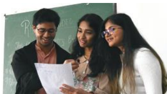
Participants in Speed-Poetry Contest