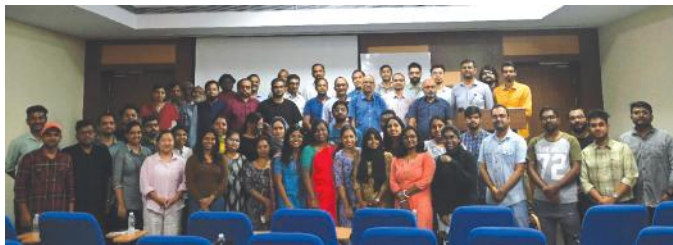
Group Photo session post Scholars Day Celebrations at F-206

The Department of Civil Engineering celebrated Research Scholars Day to welcome the new research scholars. This event was a perfect opportunity to get to know your fellow researchers, engage with faculty members, and explore the ground breaking research happening across various disciplines within Civil Engineering.