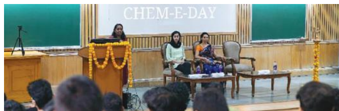
Inauguration with Chemical HoD from CBIT as a guest.

The Association of Chemical Engineers (ACE) organized ChemE Day 2025 to celebrate Chemical Engineering and promote creativity, research, and innovation within the department. The event featured a poster session, quizzes, fun games, and a session on the graphical representation of research.