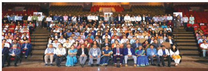
Group Photo of Delegates and Participants

Science: From Bench to Bedside, the conference featured keynote talks, young investigator presentations, and poster sessions, with speakers from leading pharmaceutical industries. Discussions covered advancements in ADMET science, new chemical entities, biologics, cell and gene therapy, and natural products. The event concluded with prize distribution for poster winners and felicitation of volunteers.