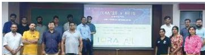
Demonstration of robotics prototypes and student exhibits during the event.

The department hosted an ICRA 2025 Satellite Event from 20 th –22 nd May 2025. The event brought together students and researchers to explore emerging topics in intelligent systems.