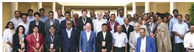
Group Photo of the Delegates