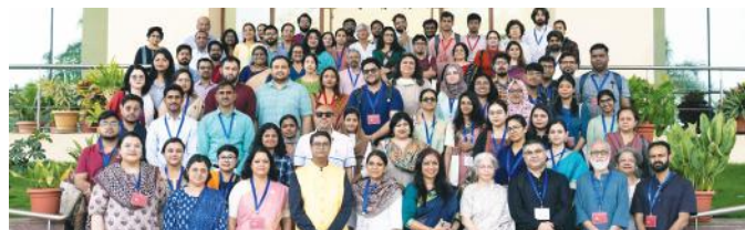
Delegates of the IACLALS Annual Conference 2025

addresses by senior faculty and IACLALS office bearers, alongside the release of the Book of Abstracts. Discussions explored intersections of literature, trauma, memory, and justice, offering critical insights into cultural representation and resilience.