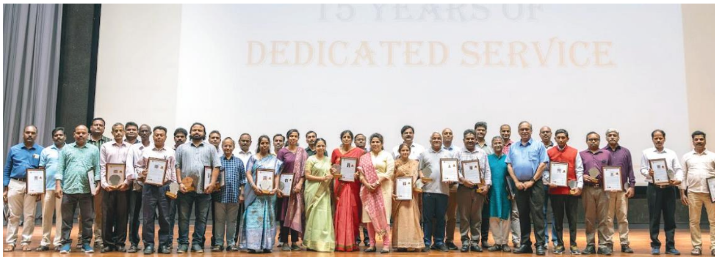
Foundation Day Awardees