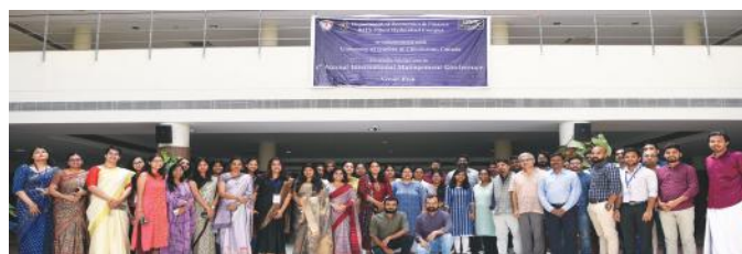
Delegates of the 1 st Annual International Management Conference (AIMC) 2025