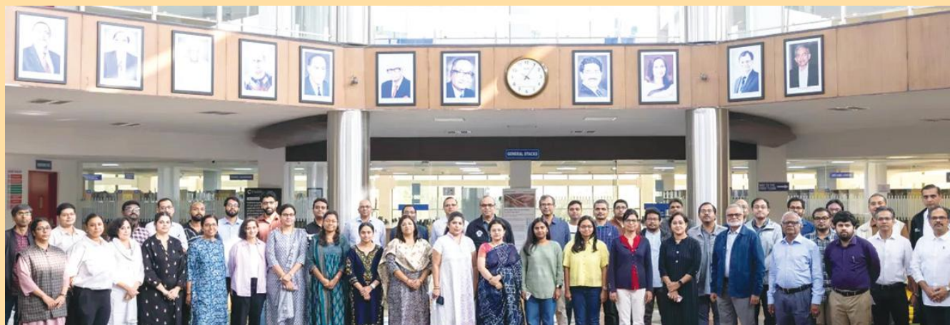
New Faculty Induction