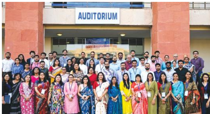
Delegates of the 6 th Annual Conference on Economics and Finance (ACEF) 2025