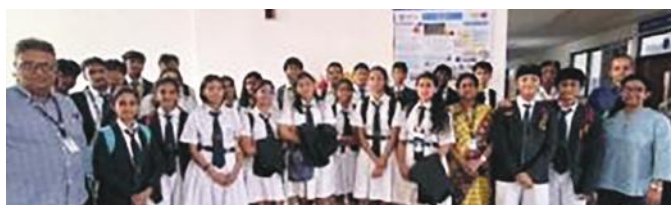
DPS Nacharam School Students

A group of 26 Grade 12 students from DPS Nacharam participated in an Apprenticeship Programme at BITS Pilani, Hyderabad Campus on 28 th –29 th April 2025, conducting experiments in the Physics and Chemistry laboratories.