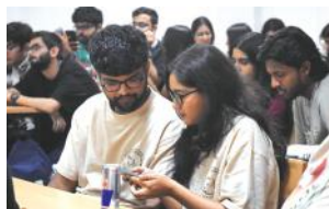
Organizing Committee for A.R.G Rhyme Rodeo