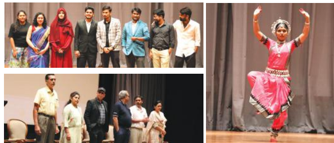
Inaugural Ceremony Proceedings

Highlights included Poster Presentations, a first-ever Hardware Expo, and a 3D Printing Workshop on 08 July. The Sports Fest on 09 th -10 th July featured exciting matches, with new additions like Women's Cricket and Kho Kho for both men and women. The Cultural Fest on 11 th - 12 th July concluded the celebrations with captivating performances, culminating in a grand closing ceremony. From groundbreaking innovations to spirited competitions, Vidwanotsav 2025 was a resounding success, reflecting the creativity and energy of the campus community.