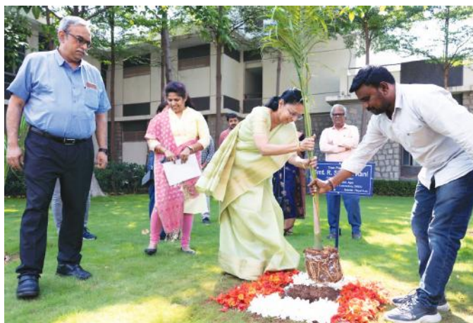
Tree Plantation by Chief Guest

The celebrations concluded with a strong sense of pride and optimism, as the entire BITSian community reaffirmed its dedication to excellence and its ongoing contribution to the nation's progress.