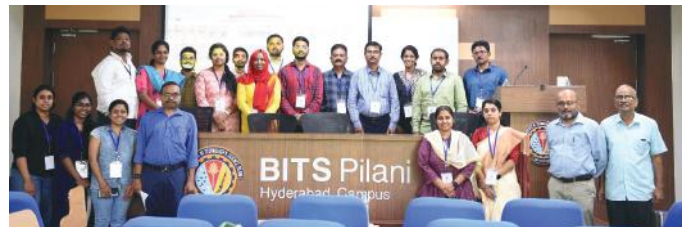
Group Photo of all Participants

World Water Day is celebrated annually on March 22 nd to raise awareness about the critical importance of water.