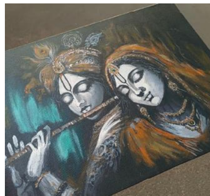
Soujanya Lakshmi Tayyala