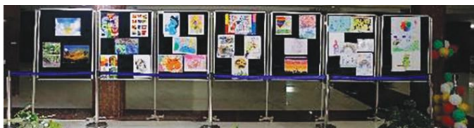
Colours of Joy - Art and Craft Exhibition