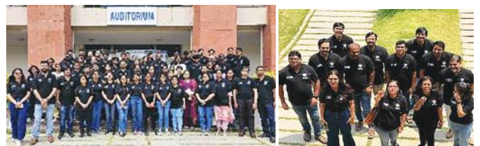
Undergraduate and PhD students interact during poster presentations.

The 3 rd Symposium on Computer Science Research Exploration (CREx-2025) was conducted on 5 th April 2025. The event saw participation from 145 students and researchers from various universities. Notably, several first-degree students actively engaged in poster presentations and interacted with PhD scholars and faculty, making the event highly inclusive and interactive.