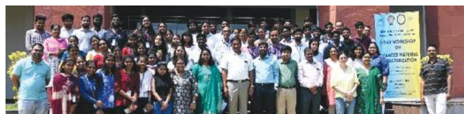
Group Photo with the Participants

The Department of Chemical Engineering organised a one-day workshop on Advanced Material Characterisation under the DST FIST SSR activity. This workshop provided participants with an in-depth understanding of modern characterisation techniques used in materials science research, including structural, chemical, and mechanical analysis of advanced materials using an Atomic Force Microscope and the Chemisorption process.