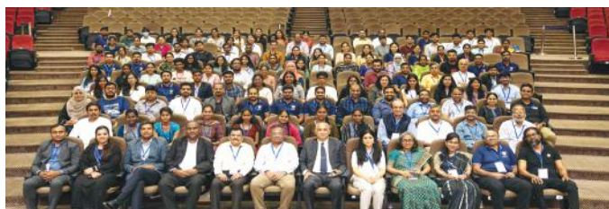
Group Photo of Delegates and Participants