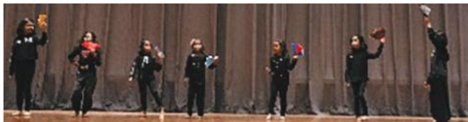
Cultural Performance during New Year Celebrations