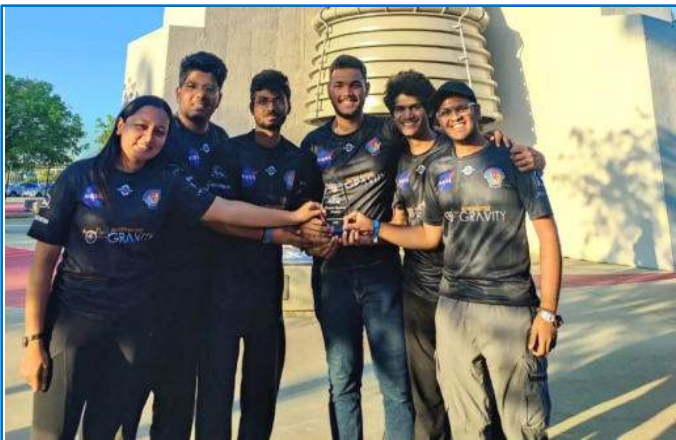
Team IKG with the award

Participation in this competition provided invaluable hands-on experience and culminated in a highly coveted award.