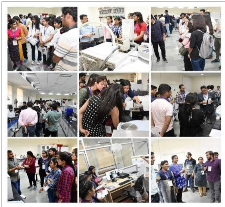
Sessions and hands-on demonstrations during workshop