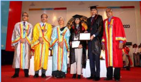
Students during convocation 2023