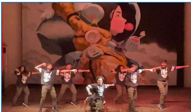
Dance performance during Apogee

The food court at Apogee 2023 was a favored spot for visitors to savor a diverse array of cuisines. The gaming