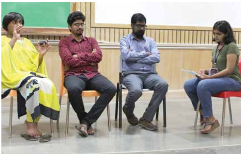
A talk on voicing sexual abuse: 'Unheard'