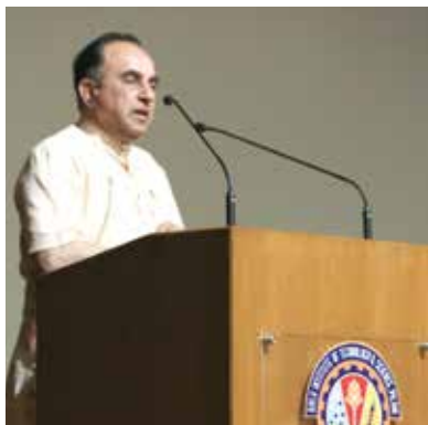
Dr Subramanian Swamy, Economist and MP in Rajya Sabha