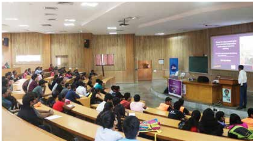
Workshops organised during ATMOS - 2018