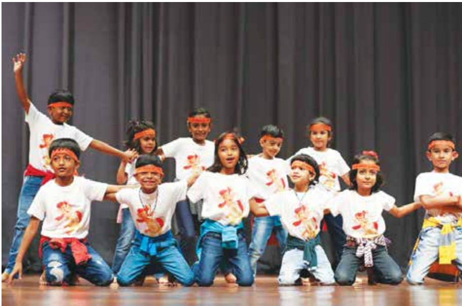
Cultural performances by children on campus during Ganesh Chaturthi.