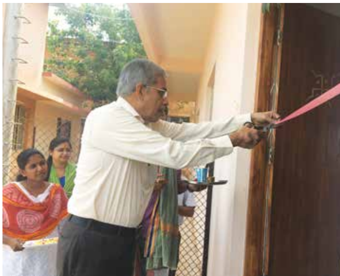
Inauguration of CRE lab, Department of Chemical Engineering, Hyderabad Campus September 24, 2018.