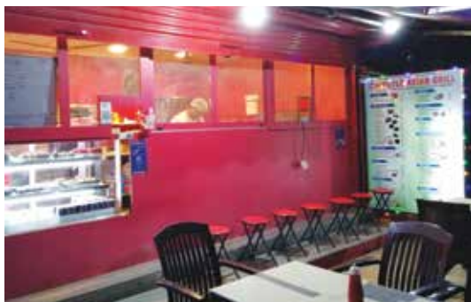
Chipotle Asian Grill