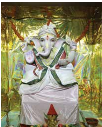
Ganesh Chaturthi Celebrations