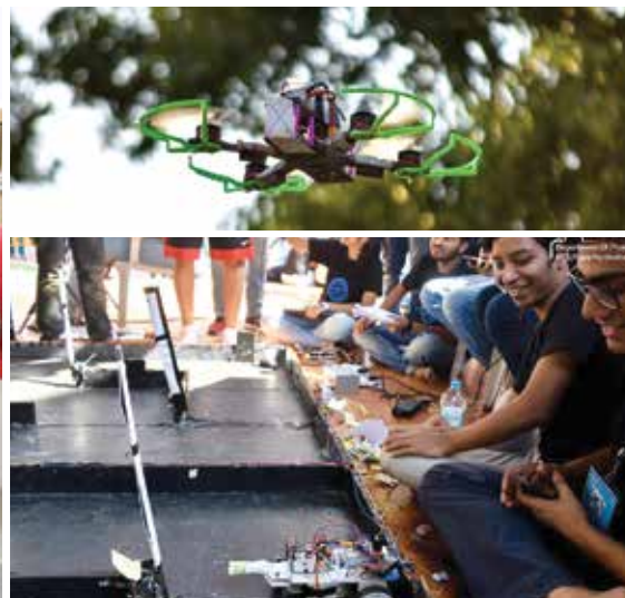
Various Technical competitions conducted during ATMOS