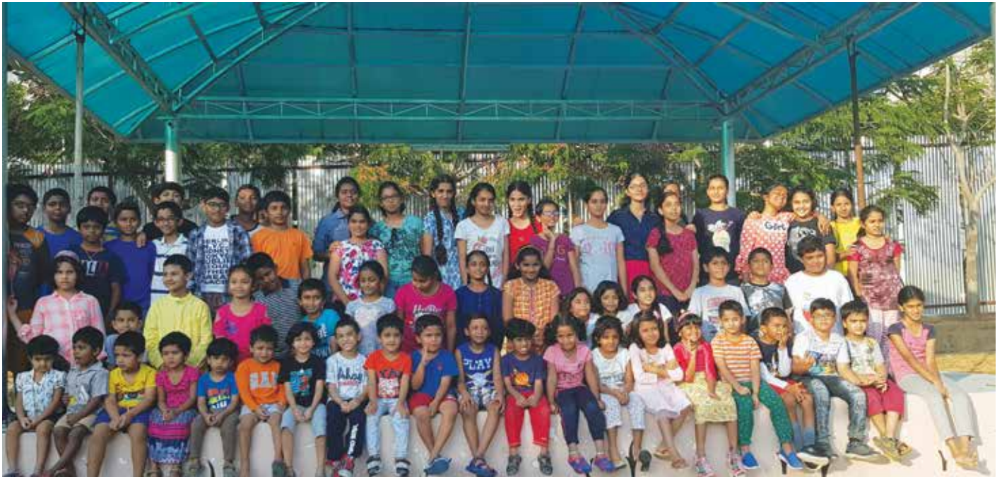
Children's day celebrations in the campus on November 14, 2018.

The community recently expanded the space for JGI School from 3 rooms to six rooms and provided infrastructure facility to the teaching staff of the School including new water dispensers, desktop, table, air conditioner etc. The community also expanded the medical centre facilities by providing new diagnostic kits, air conditioners, water dispensers and BSL training programmes for medical doctors.