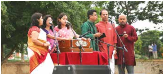
Patriotic song on the eve of Independence Day

The community celebrated a week long Ganesh Puja, Independence Day and New Year. The celebrations ended with cultural performance from kids and adults in the community in the auditorium. Professionals visit the campus to teach musical instruments, classical dance and classical music. Community Sports competition were organized for the third time for community members. Various schools from the city visited the campus to make presentations regarding their curriculum and extracurricular activities and also had an interaction session with parents to answer their concerns and queries. The community also celebrated children's day, where faculty and staff children participated in different games in the children park.