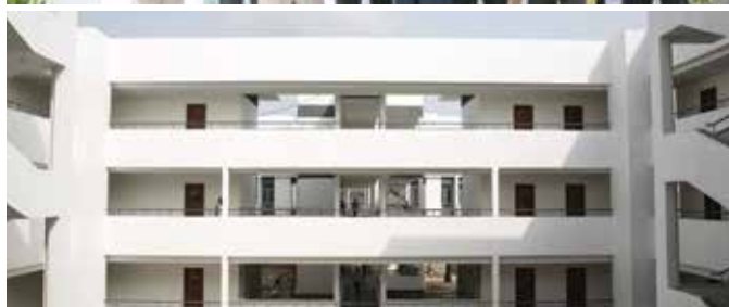
Inauguration of new academic Blocks H & I