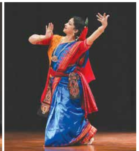
Cultural programs on the eve of Ganesh Chaturthi