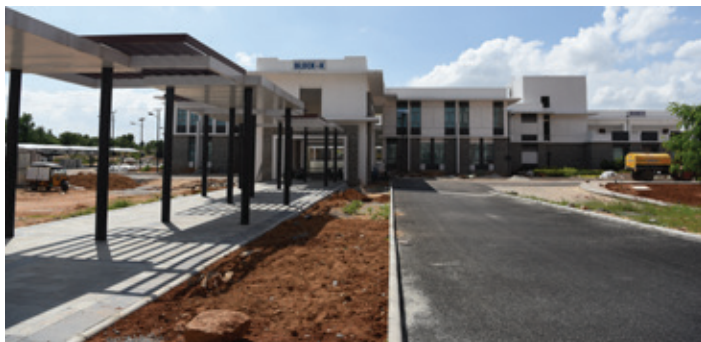
Academic Block 'K'