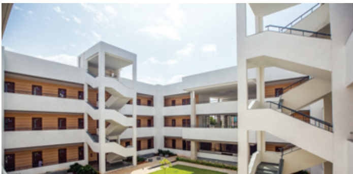
Academic Block 'J'