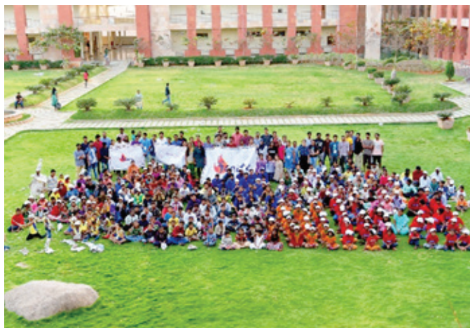
Volunteers and participants during Ignite