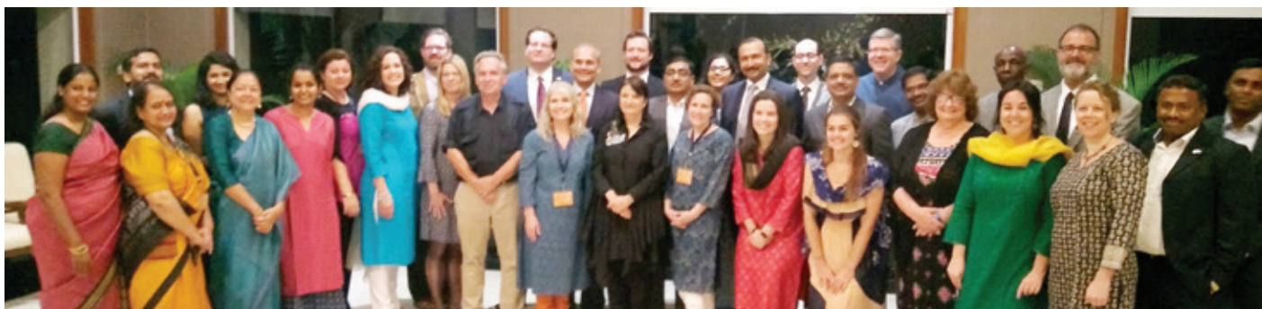
Officials of USIEF, US Consulate and Fulbright-Nehru International Education Administrators