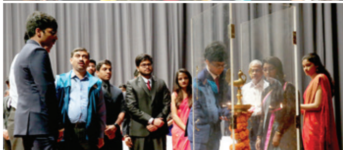
Inaugural ceremony of ARENA '19