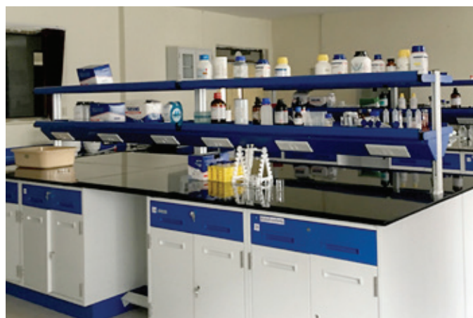
Translational pharmaceuticals research laboratory

X-ray Photoelectron Spectroscopy (XPS), a high end instrument was installed in the Central Analytical Lab (May 2019). Approximately priced around three crore rupees, this instrument is significant in determining the surface elemental compositions and the elements' oxidation states in solid substances.