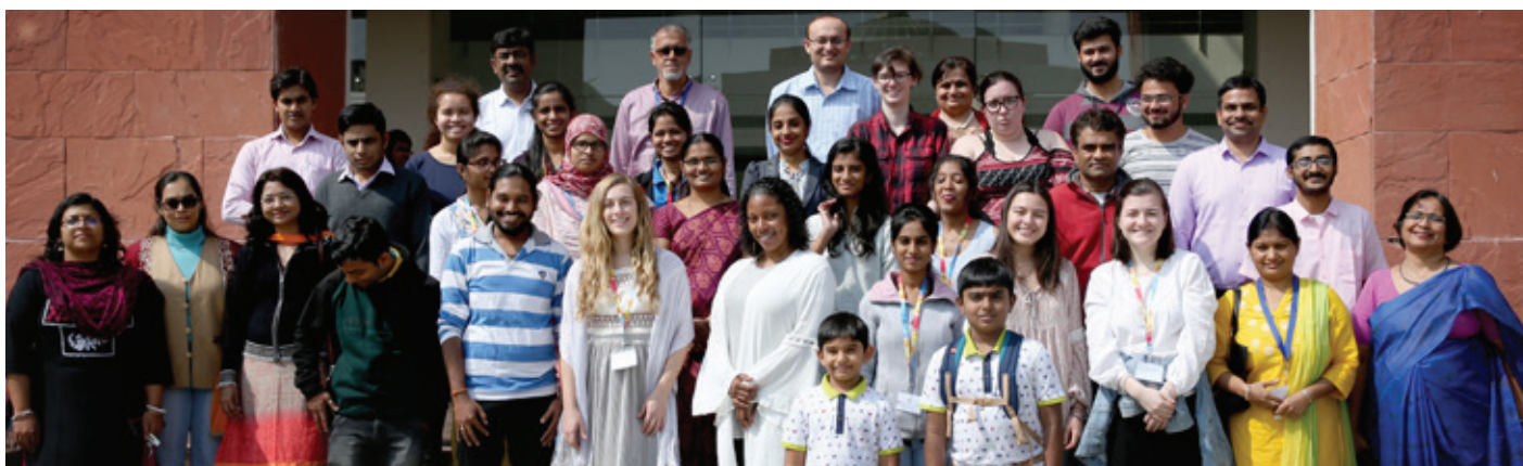
Participants of WIGH 2019