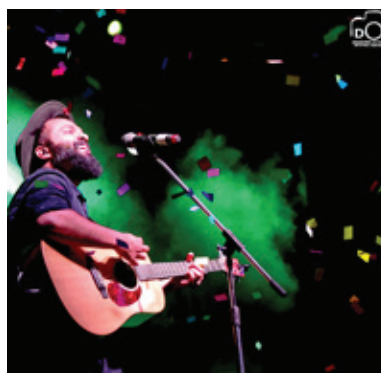
Performance by Indian Band 'When Chai Met Toast'

Contingents arrived from every corner of the country, to participate in a wide range of events. With competitions spanning photography, music, dance, drama, literature, fashion and many more, there was no shortage of talent displayed. At night, the campus remained enthused with energy and zest thanks to the brilliant proshows.