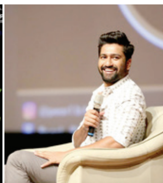
A talk by Bollywood actor Vicky Kaushal