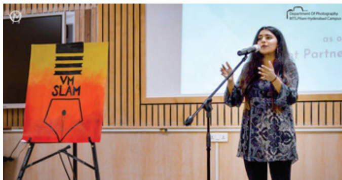
Slam poetry performance by a participant at VM Slam finals

The annual literary fest of BITS Pilani, Hyderabad Campus was held on the January 19-20. The event was conducted by the literary clubs on campus, including the English Language Activities Society, the Hindi Tarang, the Sanskrit and Foreign Languages Club and the Journal Club. The theme for this year, was 'Change Beings With Ink', which aimed to highlight the importance of literature and the power of words to bring about revolutionary changes in our society.