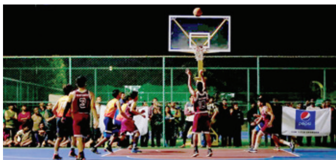
A basketball match in progress