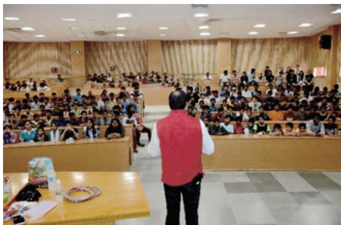
Kids enjoying a magic show during Ignite

Both the children and the volunteers took a lot away from the event, in terms of both learning and the memories that were made.