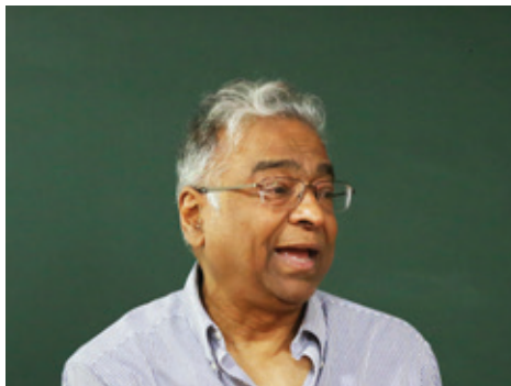
Prof. Abhay Ashtekar, Director of Institute for Gravitation and the Cosmos, Pennsylvania State University