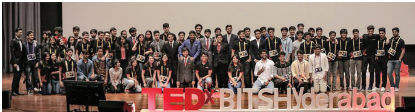
Organizing committee of TedX BITS Hyderabad 2019 with the nine speakers invited for the talk, on the auditorium stage

The wide range of enthralling experiences shared by the speakers, as they spoke about each of their journeys, was fascinating. Apart from the talks, the attendees also had the rare opportunity to interact with all the speakers and discover more about the roads less taken.