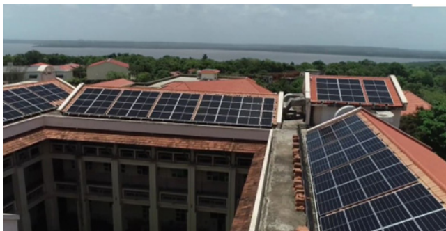
An Aerial View of the Roof-Top Solar Photovoltaic System (100 kWp) installed in the A-Wing of the Institute Building

Our Institute has achieved another milestone in producing Solar Electricity using Roof-Top SPV Technology, when in the month of April, 2022, a new capacity of 100 kWp of Roof-Top SPV System was installed. The system is installed by system integrator M/s Revayu Systems Pvt. Ltd, New Delhi, on part of the roof of A-Wing of the Institute building.