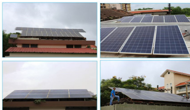
The fleet of Roof-Top SPV systems powering Street Lights on Campus: (Clock-wise from top left) Rooftop 3.6 kWp SPV System on PCC-1, Rooftop 6.0 kWp SPV System on PCC-2, Rooftop 6.75 kWp SPV System on PCC-3 and Rooftop 4.5 kWp SPV system on PCC-4

Encouraged by the performance of the SPV systems, installation and commissioning of the smaller capacity roof-top SPV systems was sanctioned by the Institute. These systems were installed phase-wise on the rooftop of PCC-3 (6.75 kWp), PCC-1 (3.6 kWp), and PCC-4 (4.5 kWp), in the years 2014, 2018 and 2019, respectively. All of these systems have been operating in grid-interactive mode and supported by the battery bank. The electricity produced is utilized for energizing sections of the street lights connected to the respective PCC. These systems can be monitored remotely using the online platforms provided by the manufacturer Schneider Electric and the system integrator M/s NCE Systems, Madgaon.