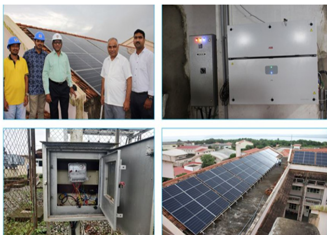
Functional Sub-systems: (Clock-wise from top Right) System Investigators,- Three-Phase Inverter (100 kWp), View of Longest String Array of SPV Modules and Bi-directional Energy Meter for the Grid-tied System in 33 kV Sub-station.

The system operates in Grid-tied mode and feeds solar electricity generated to the distribution grid in A-Wing, at the rate of about 600 Units (kWhr) per day on a sunny day, and has estimated payback period of about 4 years at the current rate of electricity of about Rs. 7 per unit. Apart from the benefits of electricity bill savings, improvement of the power quality and reduction in load on Diesel Generators are the additional benefits.