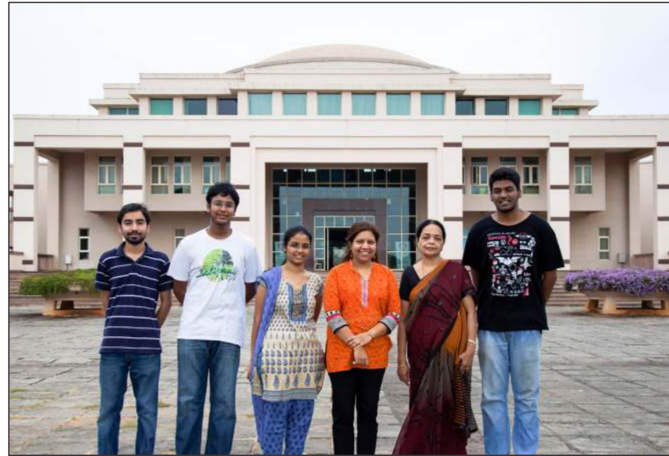
The Editorial Team