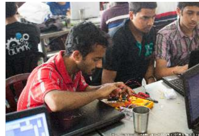
Students at CTE

CTE was established for the purpose of imparting knowledge on application oriented topics and to serve as a platform for research activities on campus. The courses offered were: 3D modelling and Analysis using Catia, C#, Web Design and Development, Introduction to Python and Application Development in Qt, Advanced Image Processing, Introduction to Electronics in Robotics. Apart from these, CTE organised various Hackathons where students from different courses were encouraged to team up and work on cross disciplinary projects. Another such attempt to encourage the spirit of technical innovation was CTE Kick-Starter which offered funding to feasible and innovative ideas. This event provided a total amount of 90,000 to eight such projects.