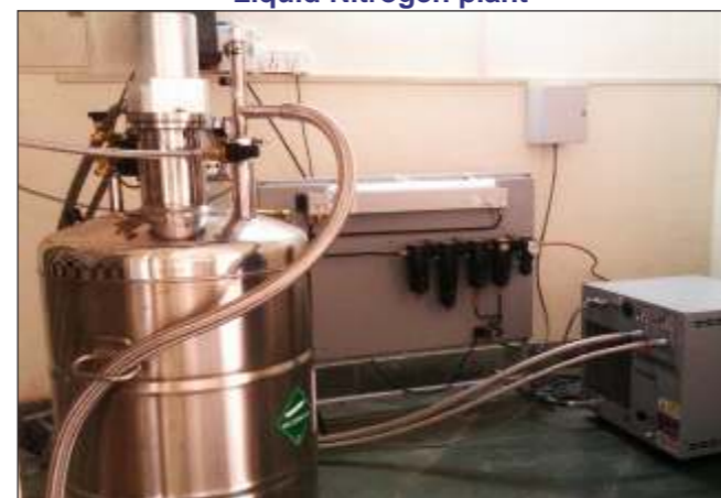
Liquid Nitrogen plant