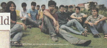
mi's Waves Viva la Vida 2010 joins hands with Times of India's peace Aman ki Asha for a three-day extravaganza